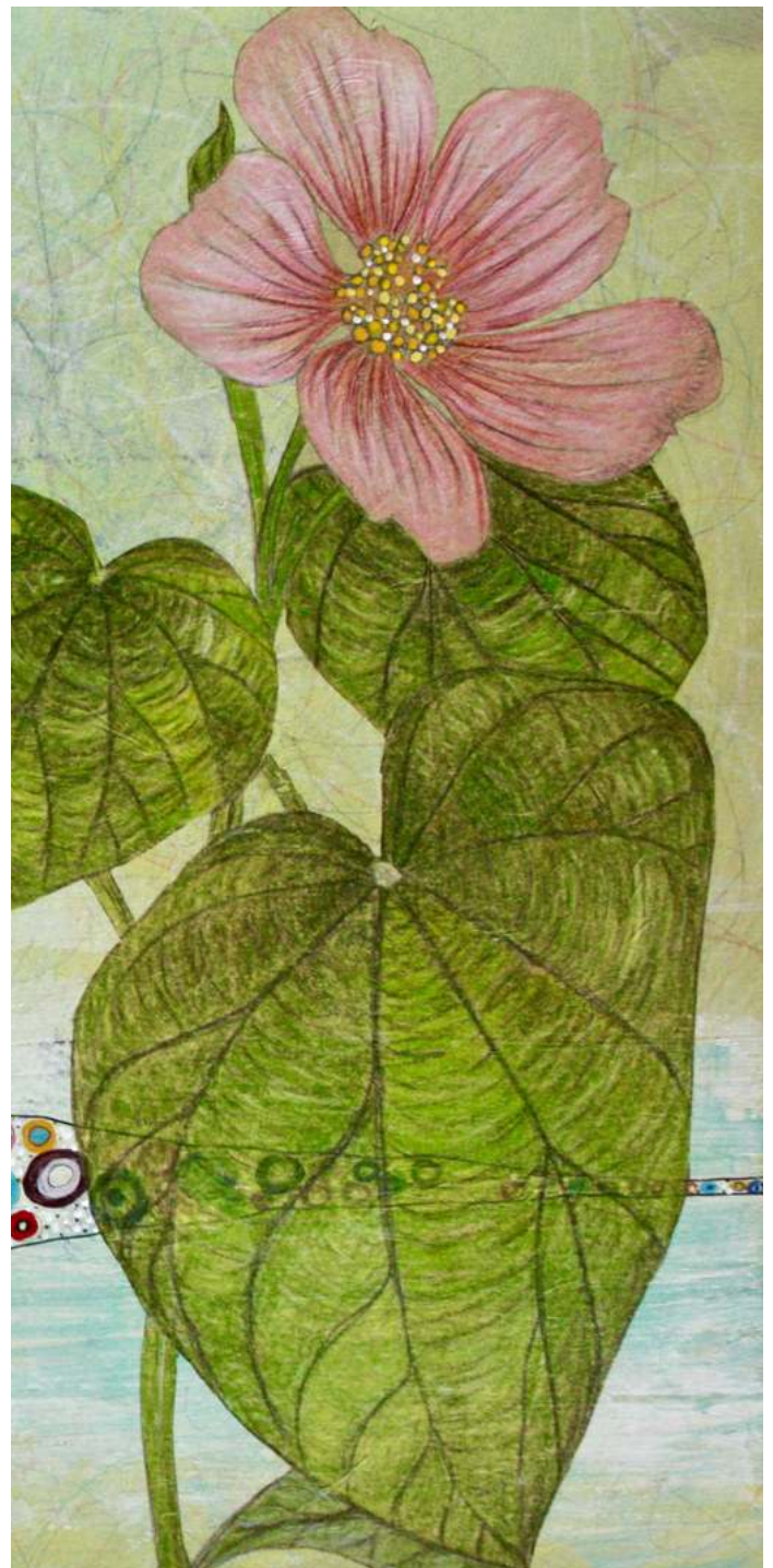
Image text: Drawing of a pink flower with a speckled yellow centre, connected to a stem with large bright green leaves.