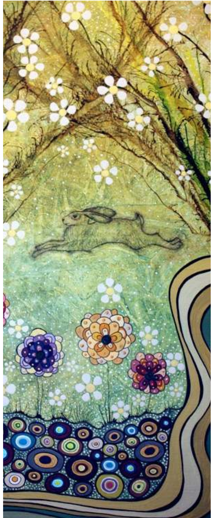
Image text: Painting of a rabbit leaping through a thicket with colourful abstract flowers underneath them.