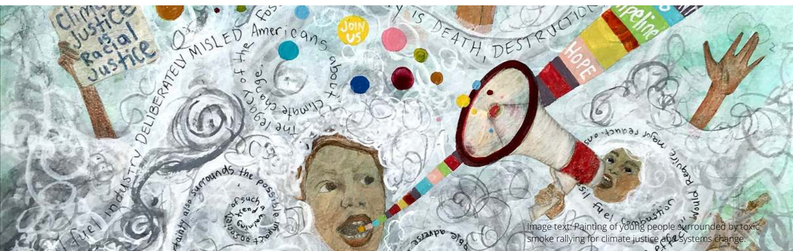
Image text: Painting of young people surrounded by toxic smoke rallying for climate justice and systems change.

Failure to address inequities that co-inform resilience capacities can fundamentally undermine resilience initiatives.