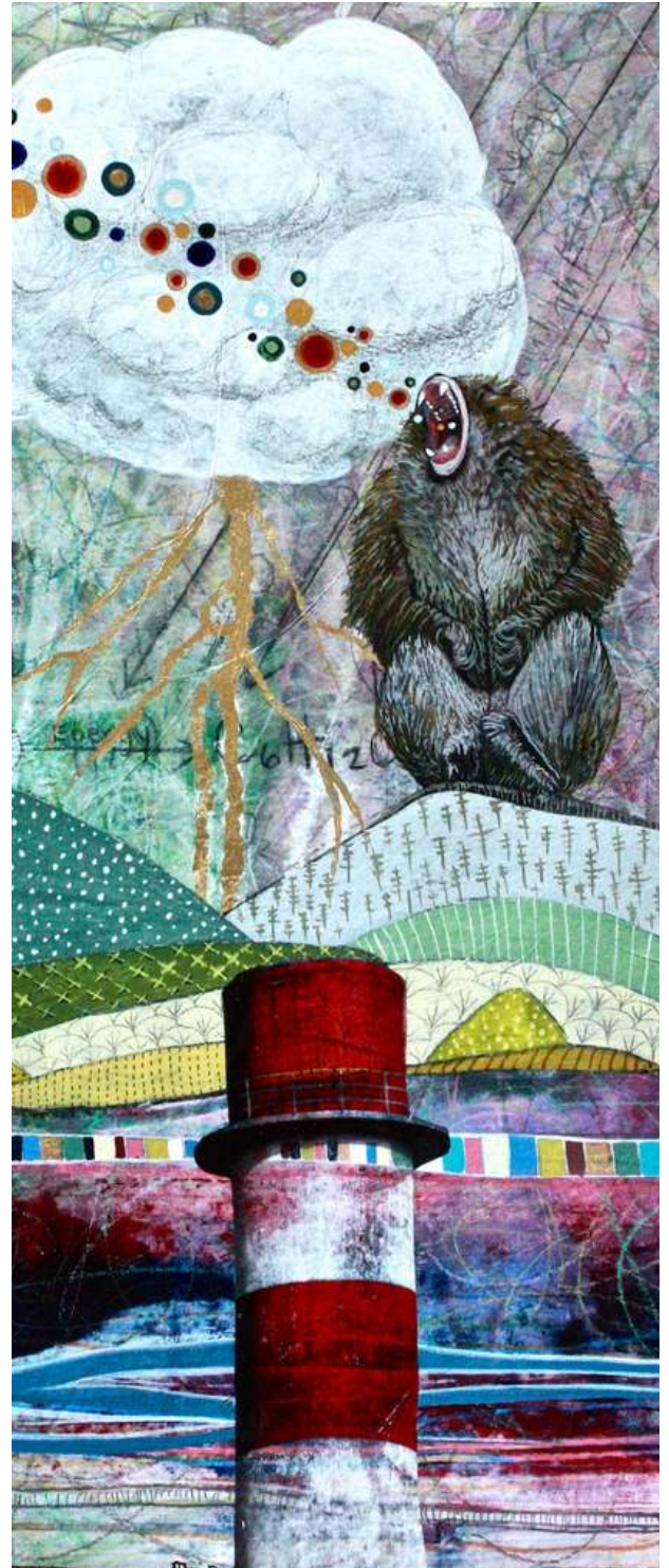
Image text: Painting of a baboon screaming out bubbles of colour, sitting on a hill looking over an old fossil fuel emissions stack.

Solastalgia: pain or distress caused by the loss of a place you feel deeply connected to. A sense of desolation people may feel, consciously or unconsciously, when their home or land is lost through processes of climate change like magnified fires, flooding or sea-level rise.