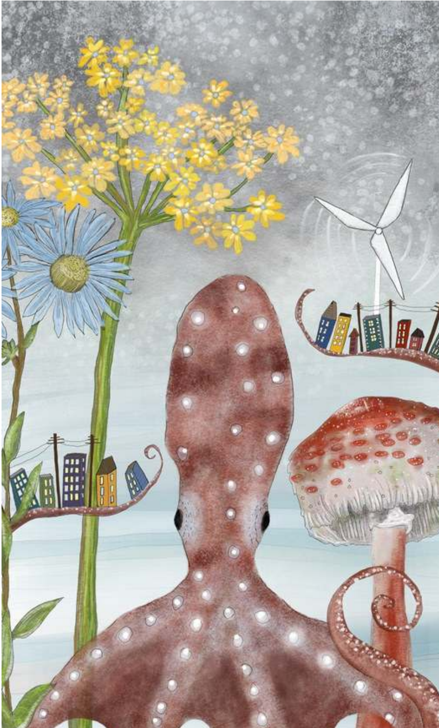
Image text: Drawing of a pinkish red octopus surrounded by flowers and a large mushroom holding up a sustainable city with a windmill.

Resilience is fundamental for communities amid climate change. But what actions, mindsets or processes can help to give rise to community resilience?