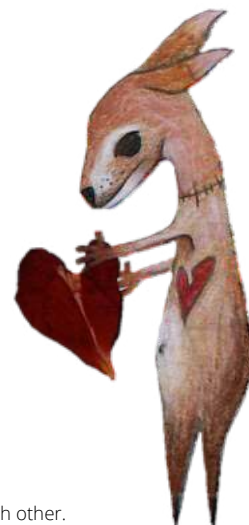
Image text: Drawing of two made up creatures holding red heart shapes out to each other.