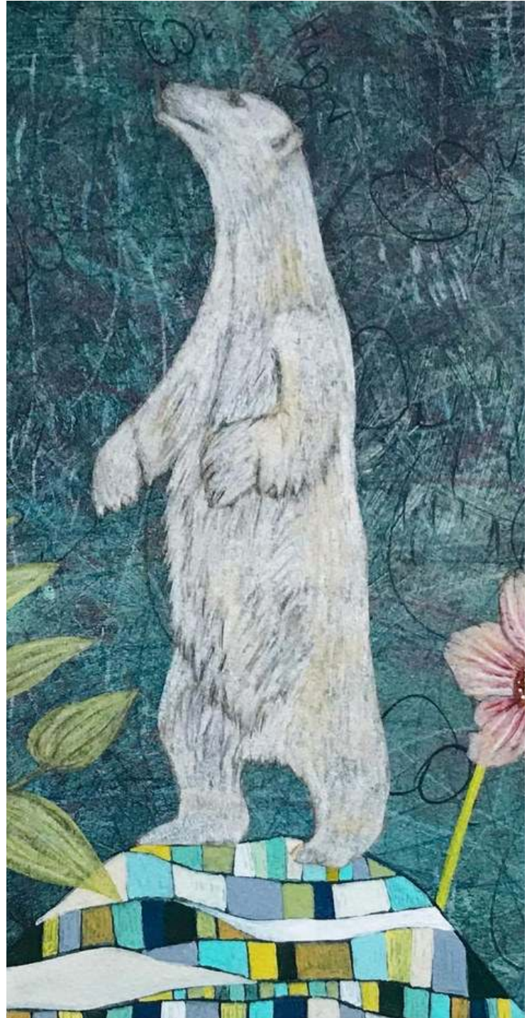
ALT Text: A polar bear standing on a small ice hill against a bluish grey sky with flowers and leaves next to it, looking for the sea ice.