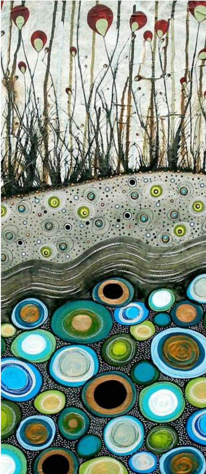
Image text: Abstract painting of scarlet poppy buds atop a hill of abstract soil and colourful rocks in shades of blue.